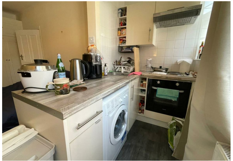
Grove End Road, London £1,650 Per Month Not specified